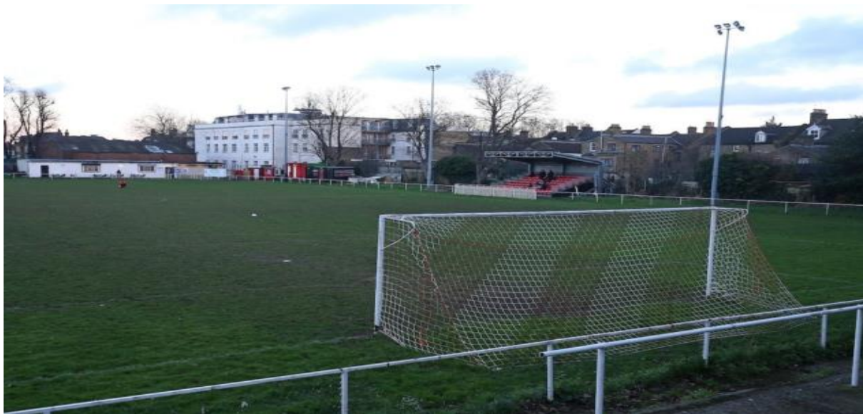
Dutch Euro (New Stand)

Train to Forrest Gate Railway Station then 11 minute walk come out of Forest Gate station turn right and walk down Woodgrange Road till the cross roads then turn right along Romford Road then first right into Disraeli Rd the ground entrance is at the bottom of the road.