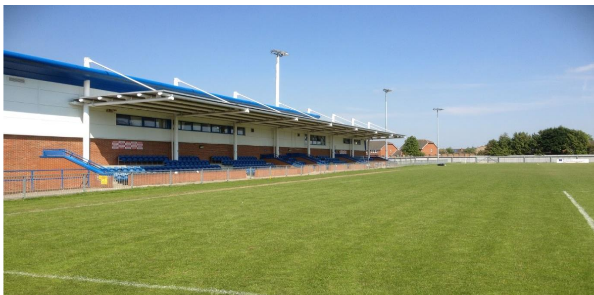
The new Stand at The Gore Ground

past The Pheasant pub on your left, straight through the double roundabouts and then fork right into Wymers Wood Road. Look for the sign Pines Hotel. The entrance to the ground is 50 yards on the right after turning into Wymers Wood Road.