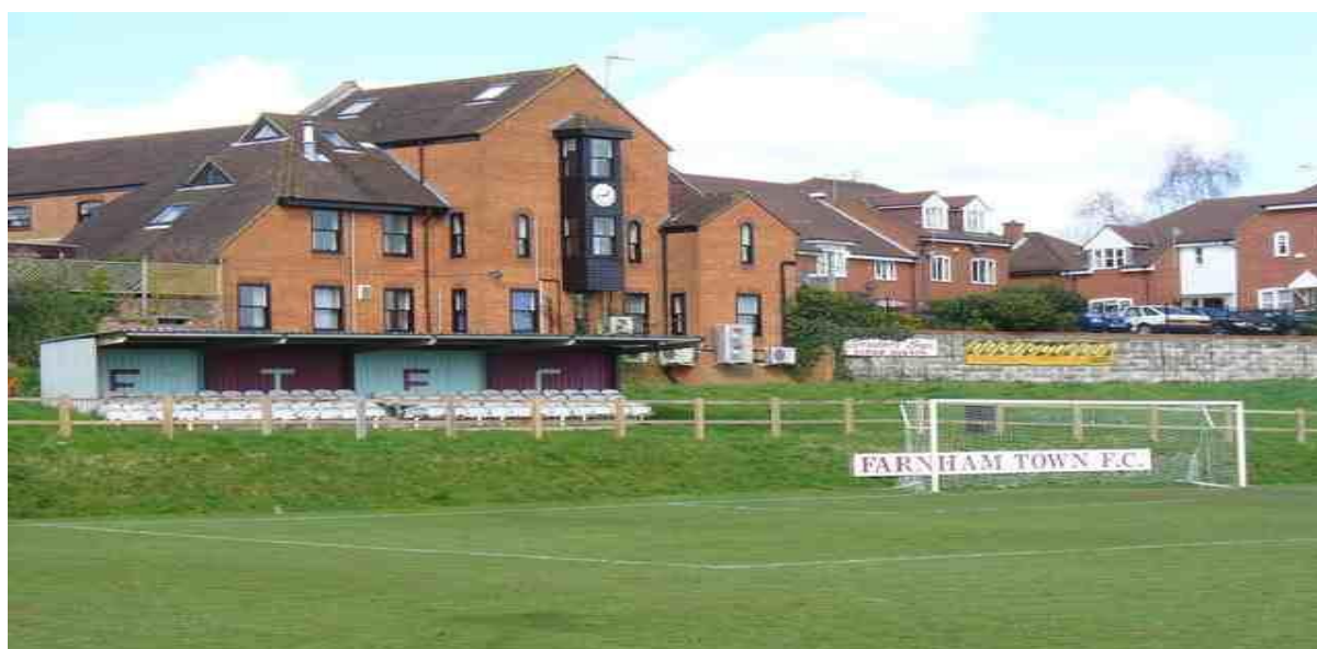
The Enclosure & Stand