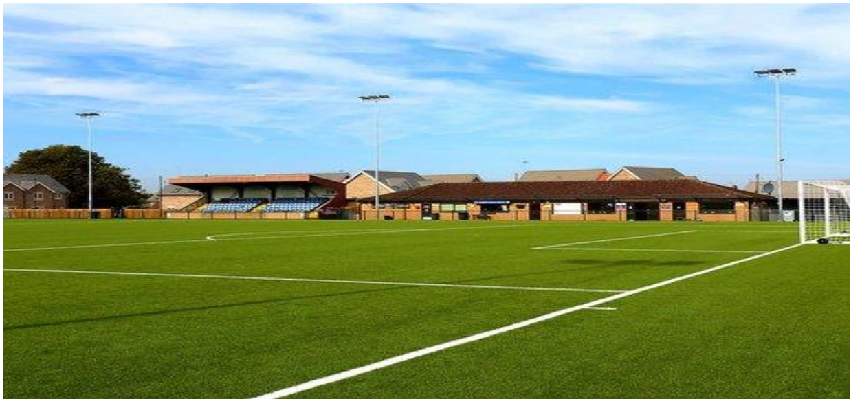
The new pitch and pavilion