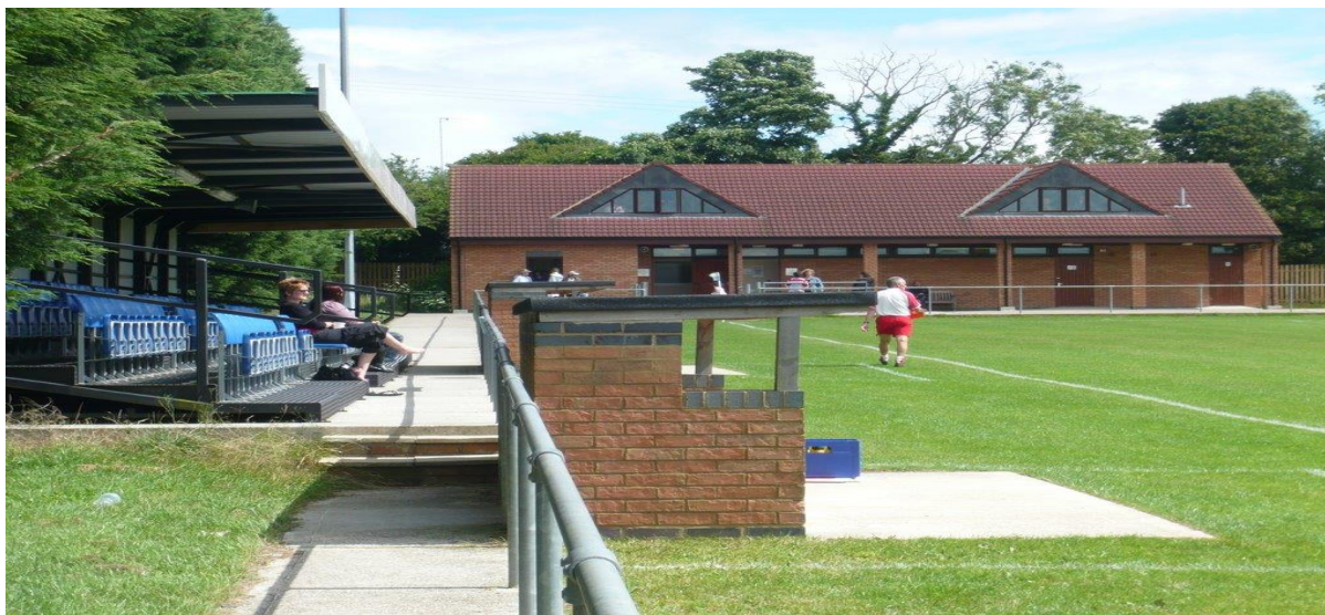
Stand & Pavilion