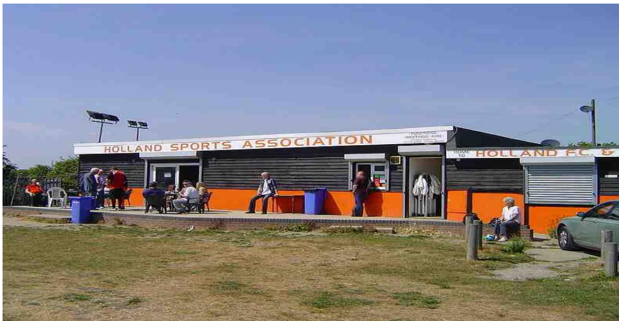
Dulwich Road pavilion

For midweek games you have to get the train to Thorpe-le-Soken Railway Station walk over and take the First Bus in Essex 3 bus to Clacton, opposite Coppins Green on St. Osyth Road from there you turn left and the ground is 9 minutes down the right going home walk down to the railway station and take the train home.