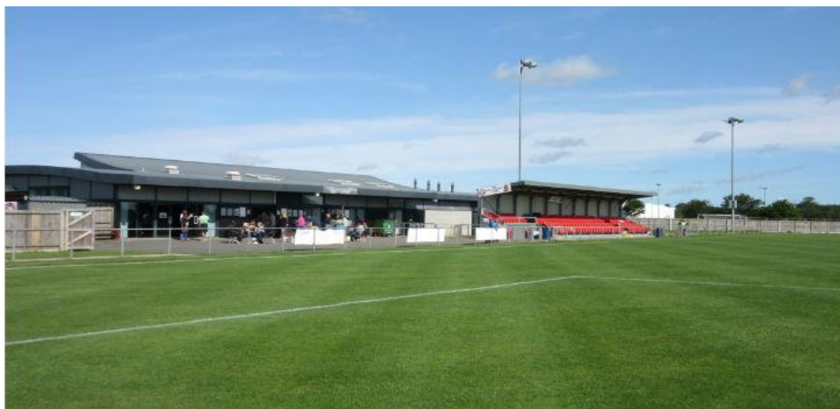
The New Stand

From the north take the A10 to New River Bank in Littleport then take the Branch Bank and Queen Adelaide Way to Stuntney Causeway/A142 in Ely and continue to Newmarket Victoria Tower roundabout then take the third exit onto the High Street (A1304) and at the Shell Garage take a left onto Dullingham Road (B1061) and at the end turn right onto the A143 then in Haverhill take a left for Eaton Tower Park the ground is on the left about 300 yards with ample parking