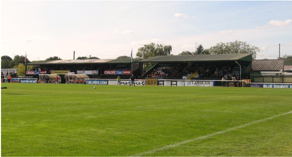
The Main Stand