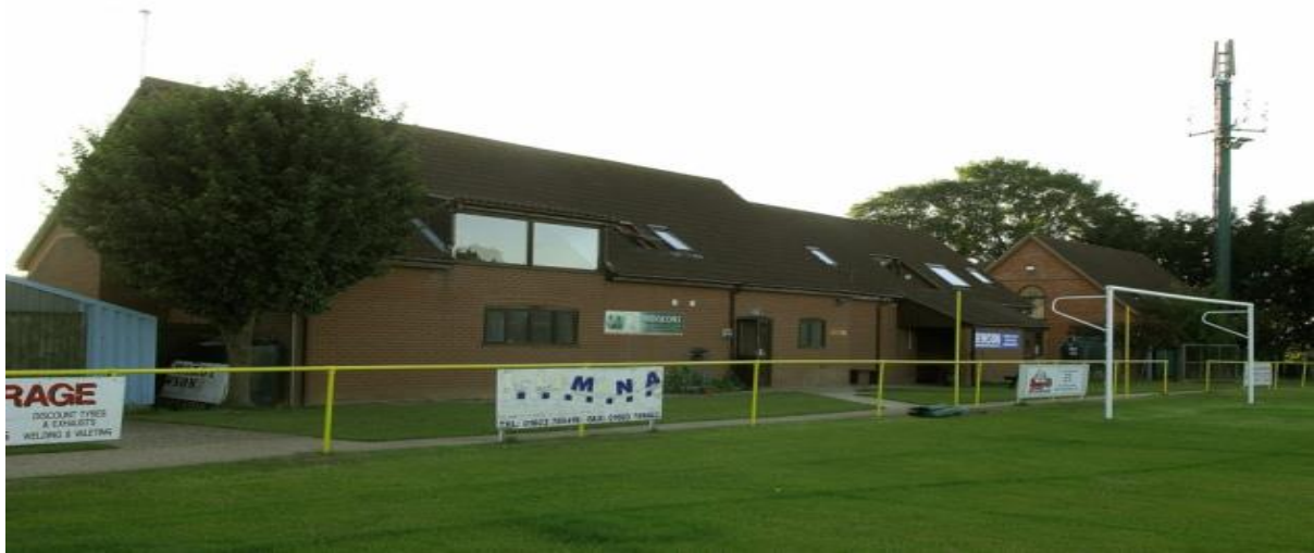
New dressing rooms