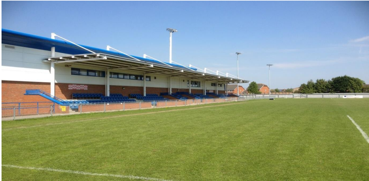
The new Stand at The Gore Ground