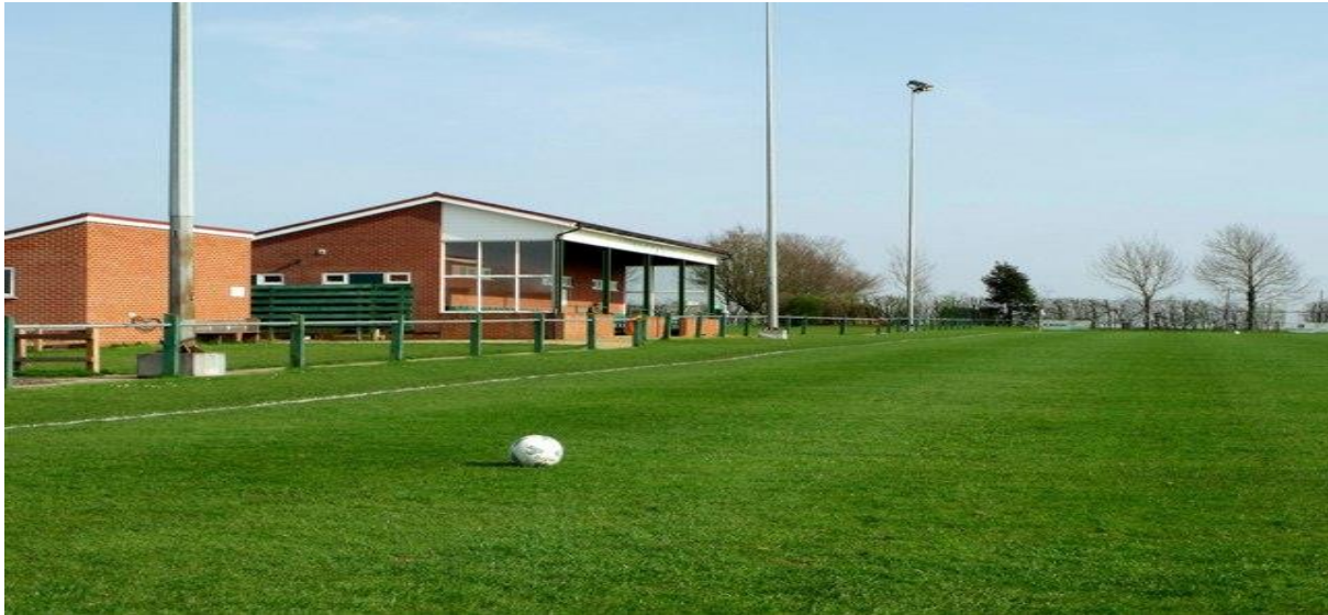
The new Stand