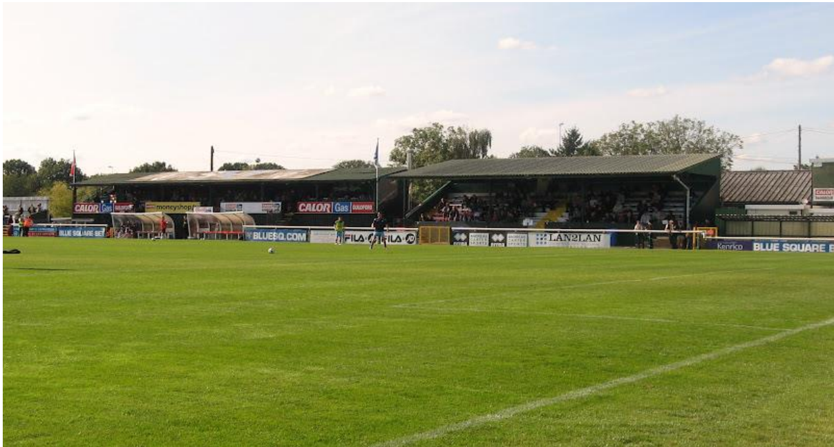
The Main Stand

Exit M25 Junction 10 and follow A3 towards Guildford. Leave at next junction onto B2215 through Ripley and join A247 to Woking. Turn right at the roundabout into Wynch Hill Lane, towards Old Woking and this road leads into Kingfield Road and the entrance to the ground is down on the right opposite the Leisure Centre.