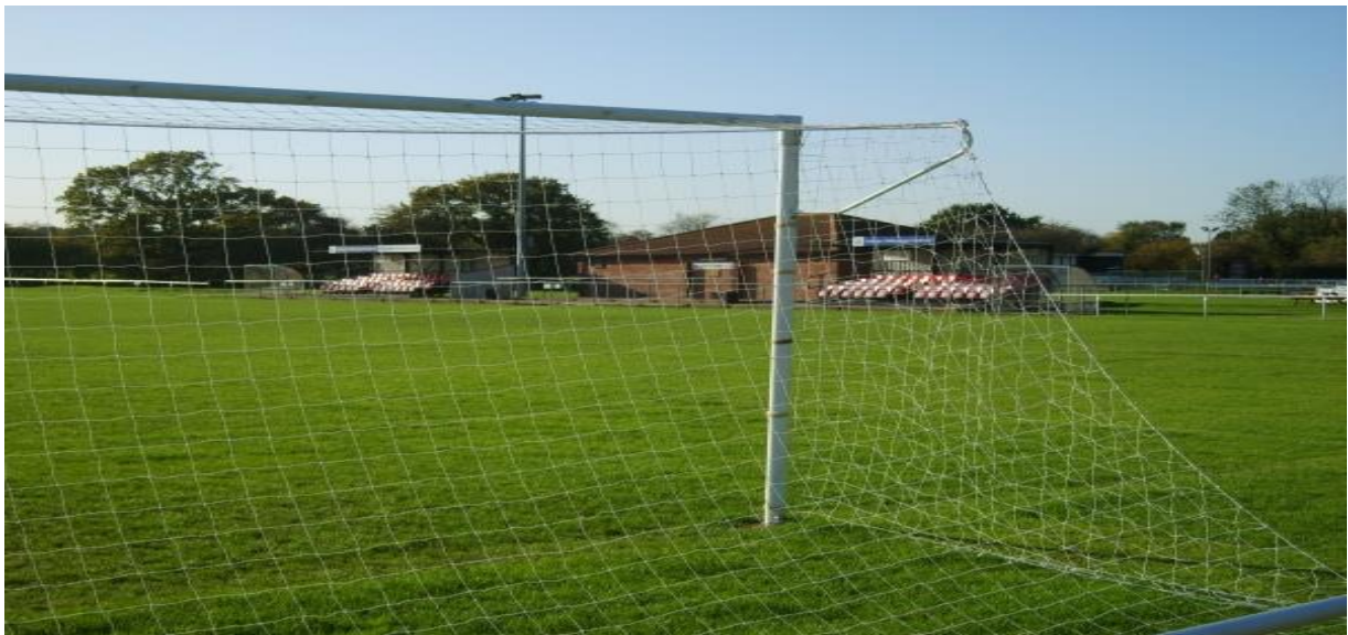
Eastwoodbury Lane Stand

Train to Billericay Railway Station then walk over and take the First in Essex 100 bus to B& Q then walk down to the lights cross the road then take a left and then first right for the sports ground.