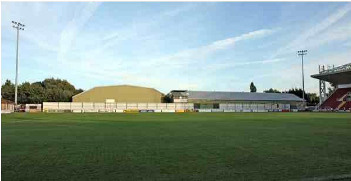
Chris Lane Terrace

Exit M25 Junction 11 takes the A317 and then the A320 towards Woking. Continue on the A320 through Woking town centre. Then follow the road left over the Railway Bridge and passing a Woking Community Hospital on your left you will come to a fork in the road, take the left fork into Claremont Road towards Old Woking then at the bottom of Claremont Road turn left onto Kingfield Road and the entrance to the ground is down on the right opposite the Leisure Centre.