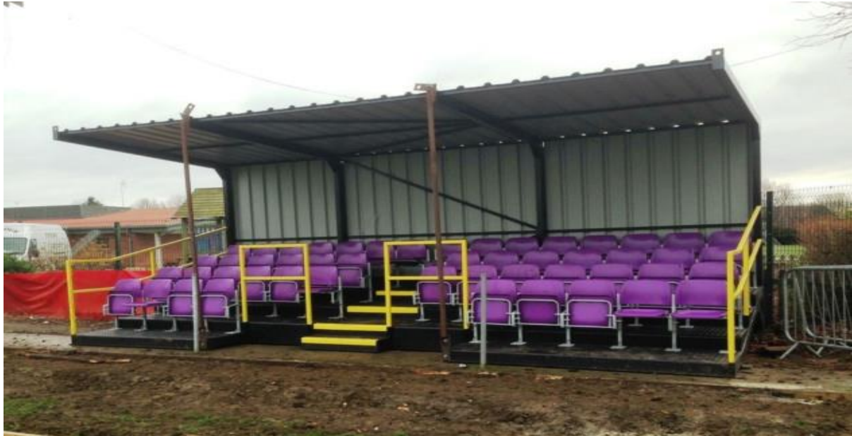
The New Stand