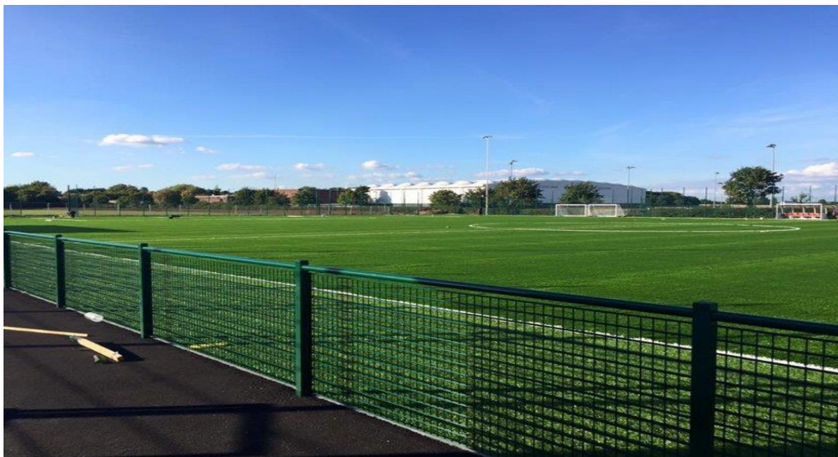
The new pitch

From the South take the A12 to Chelmsford then the A130 on the Essex Regiment Way to Chatham Green Roundabout there take the third exit onto the A143 then meege onto the A120 for Stanstead Airport then after about three miles Take the B1417 exit towards B1256 for Felsted/Stebbing and at the roundabout take the third exit onto the B1417 then do a left and first right at the Palms continue to Great Barfield there at the Coop take the first right onto the B1057 and follow the signs for V1057 to Haverhill then take a left onto the A143 to the Cricket club there turn right into Manor Road and at the end take a left and first right and first left and the ground is 100 yards on the right.